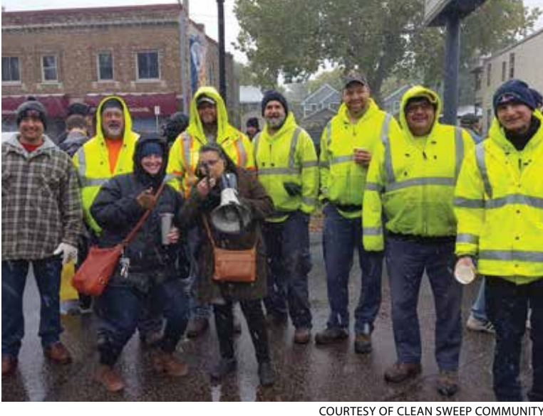
A City Crew ready with compactor trucks