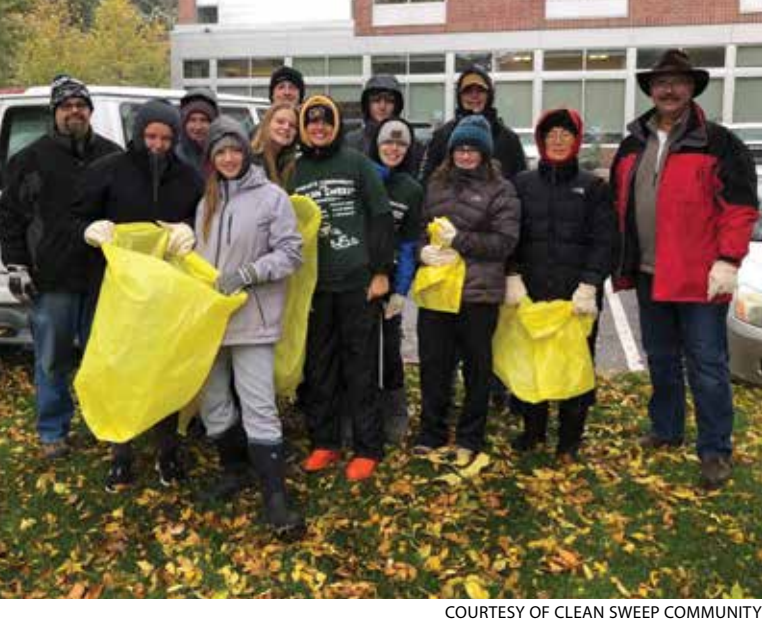
Crew of 13 ready to roll